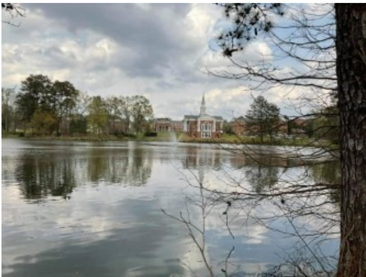
Even when there are no classes, the Wesleyan campus provides lots of opportunities for a relaxing stroll.