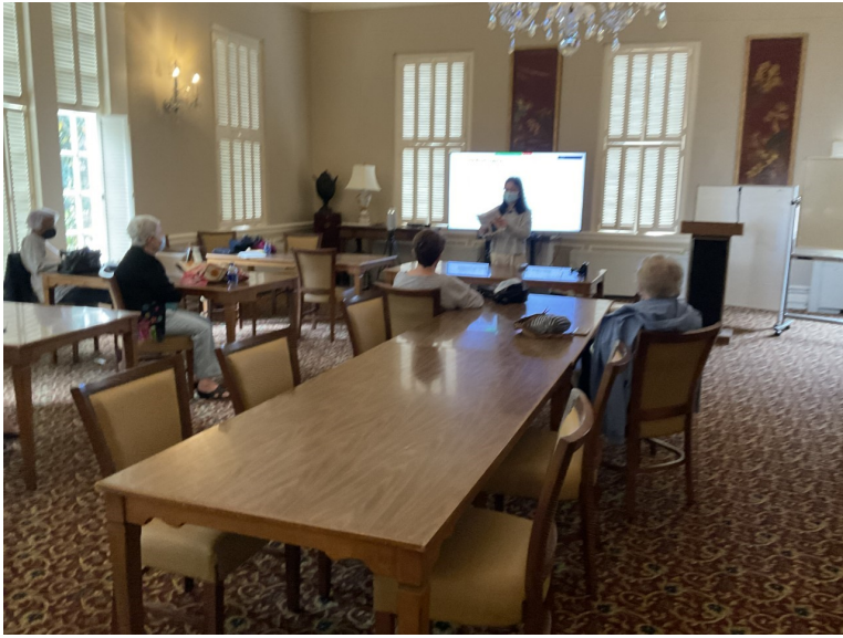
Members learned all about silk production & application in classes taught by the Confucius Institute .