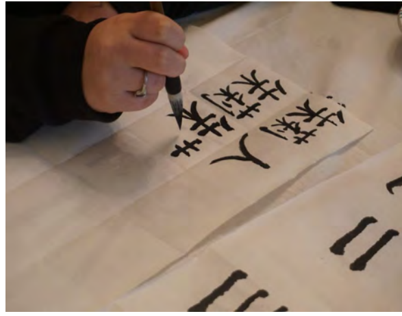
The complexity of Chinese Calligraphy provides beauty and communication in this remarkable art form.