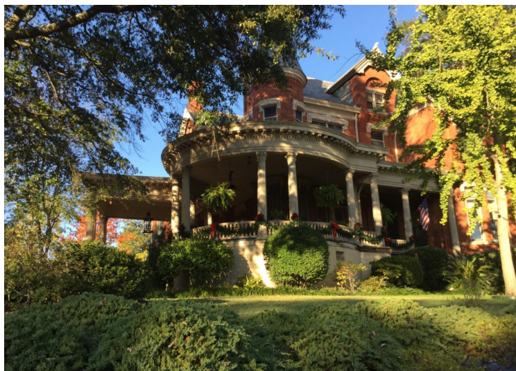
Macon's Hay House in Defining Classic Architecture