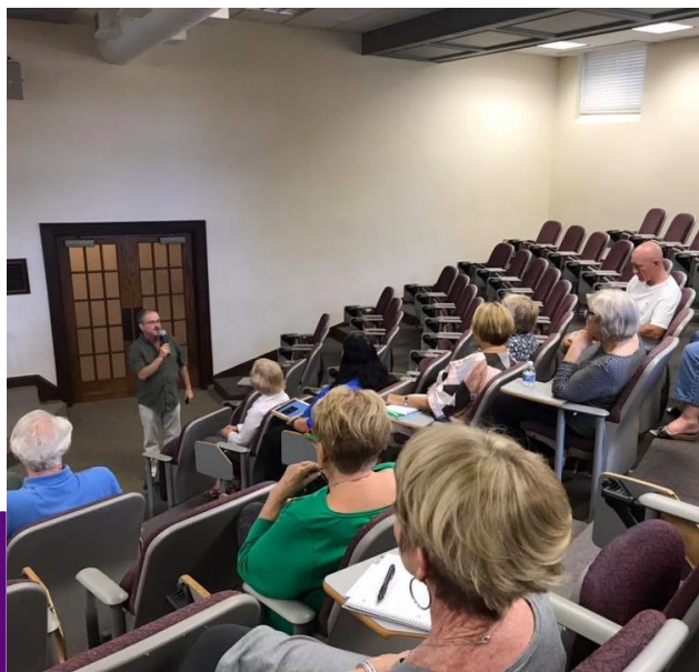
Students explore how our brains affect human behavior