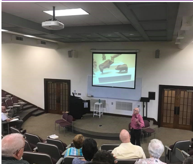
Paul of Tarsus was the subject of this brand new WALL class

Don't forget that Wesleyan art galleries are open Monday-Friday from 1:30 - 5:00 PM and the Wesleyan Market is every 2nd Saturday from 10:00 AM – 2:00 PM