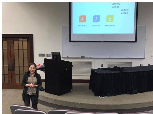
In the Regions of China course we learned there is more to China than Shanghai and Beijing.