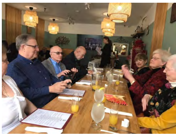
Classmates enjoy a meal before attending the opera Carmen.

Don't forget that Wesleyan art galleries are open Monday-Friday from 1:30 - 5:00 PM and the Wesleyan Market is every 2nd Saturday from 9am-1pm.