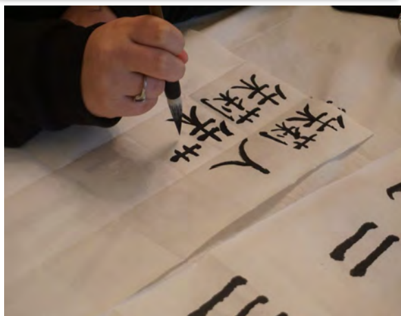
The complexity of Chinese Calligraphy provides beauty and communication in this remarkable art form.

Wesleyan College offers so much to our WALL members and to the community at large. Many events on campus are open to the public (most are free of charge).