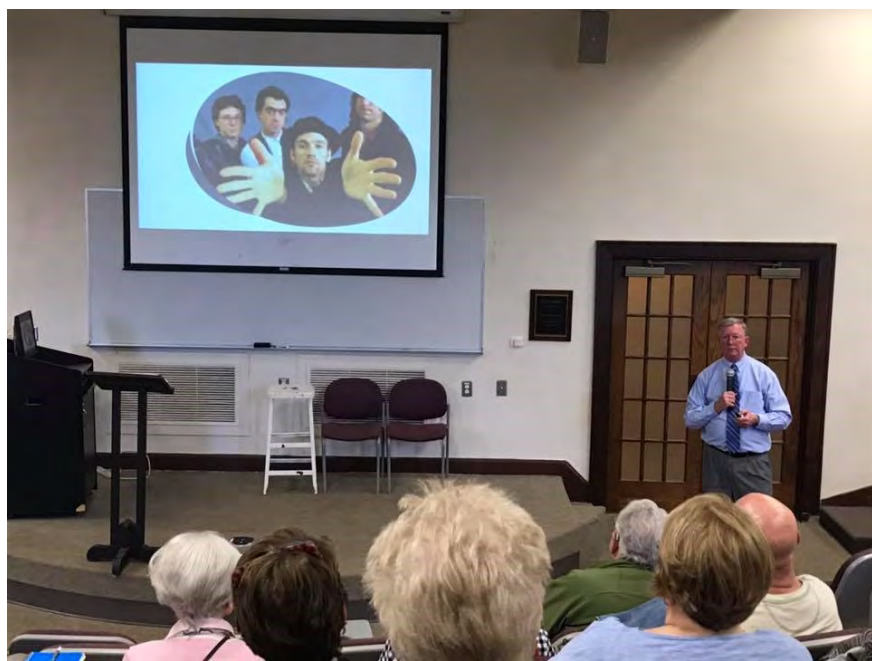
An exploration of Local Knowledge led to a discussion of the iconic rock band REM. Two members of the multimillion song selling band are from Macon.