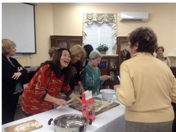
Members enjoy WALL's popular Chinese Culture Class